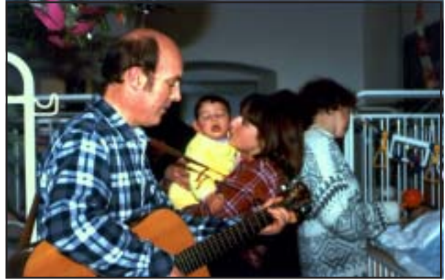
UK volunteers playing music in Siret, Christmas 1992

Over 15 years ago, volunteers from the UK spent Christmas playing music to the orphans and children with special needs in the Neuropsychiatric Institution in Siret, northern Romania.