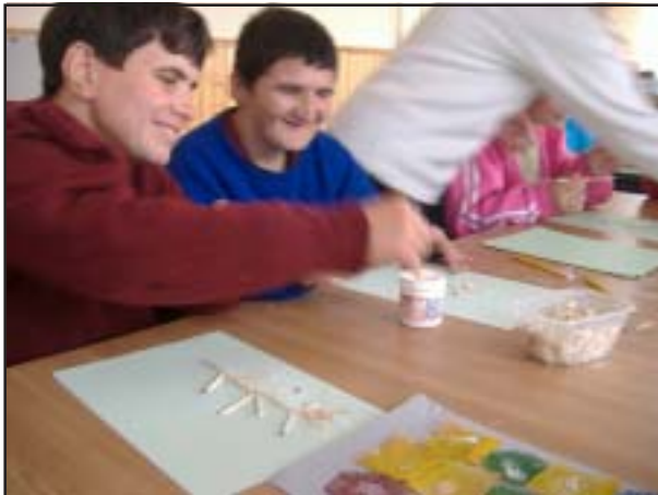
Fine motor skills session, 16 years on

Over 15 years ago, volunteers from the UK spent Christmas playing music to the orphans and children with special needs in the Neuropsychiatric Institution in Siret, northern Romania.