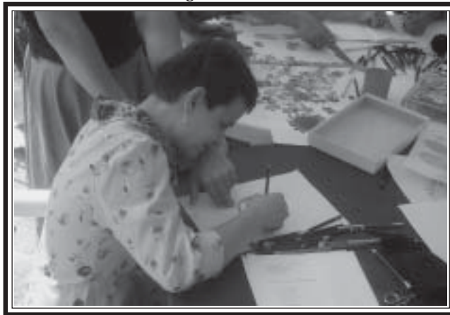
Working hard at the school